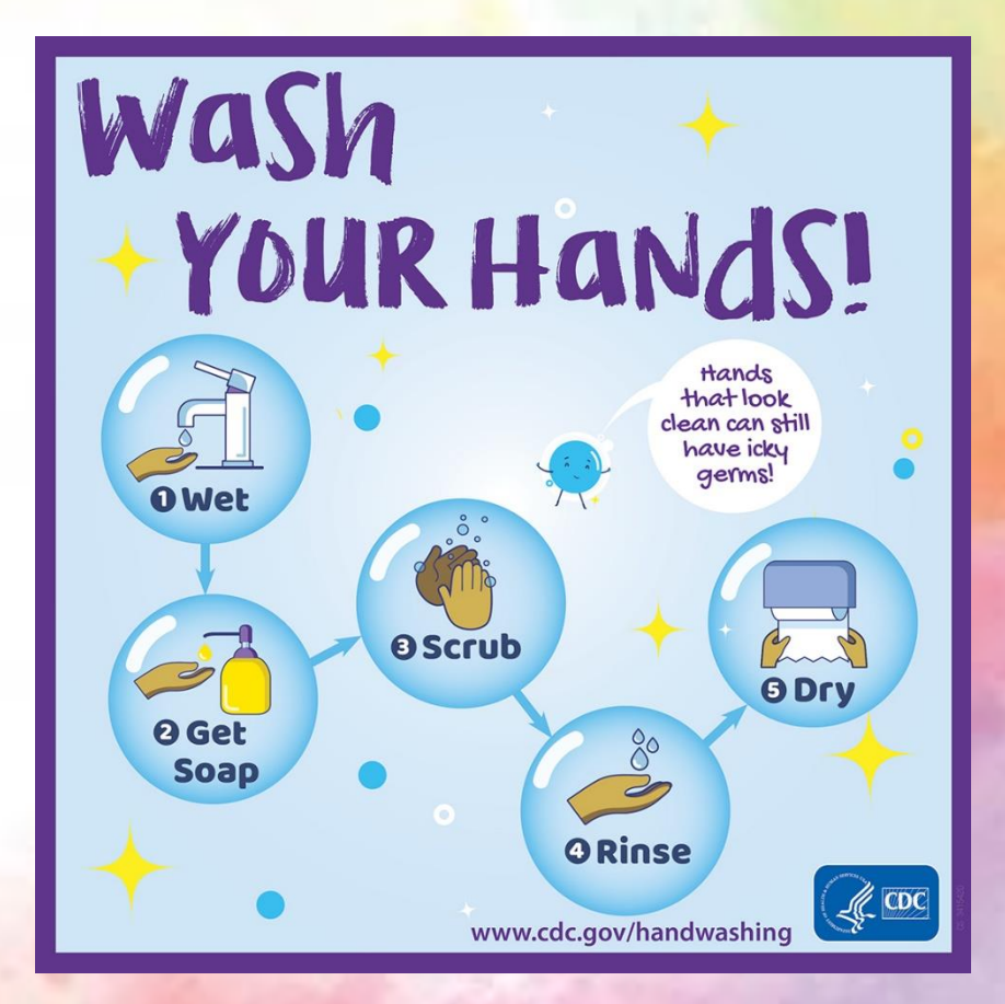
Washing our hands regularly.