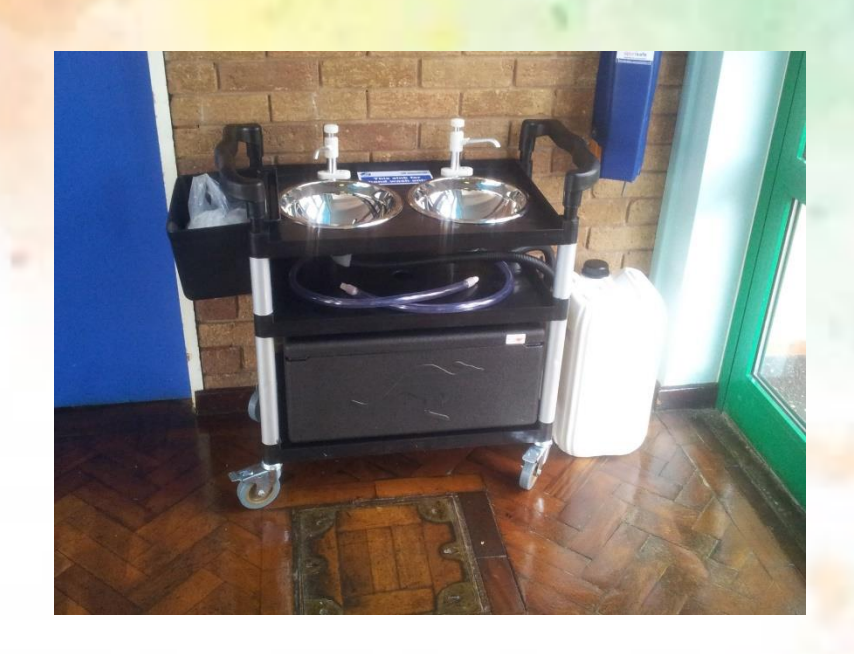
Mobile handwashing unit in the classroom