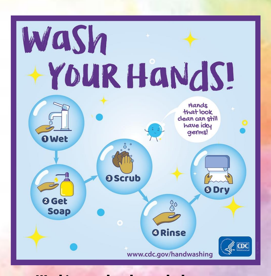
Washing our hands regularly.