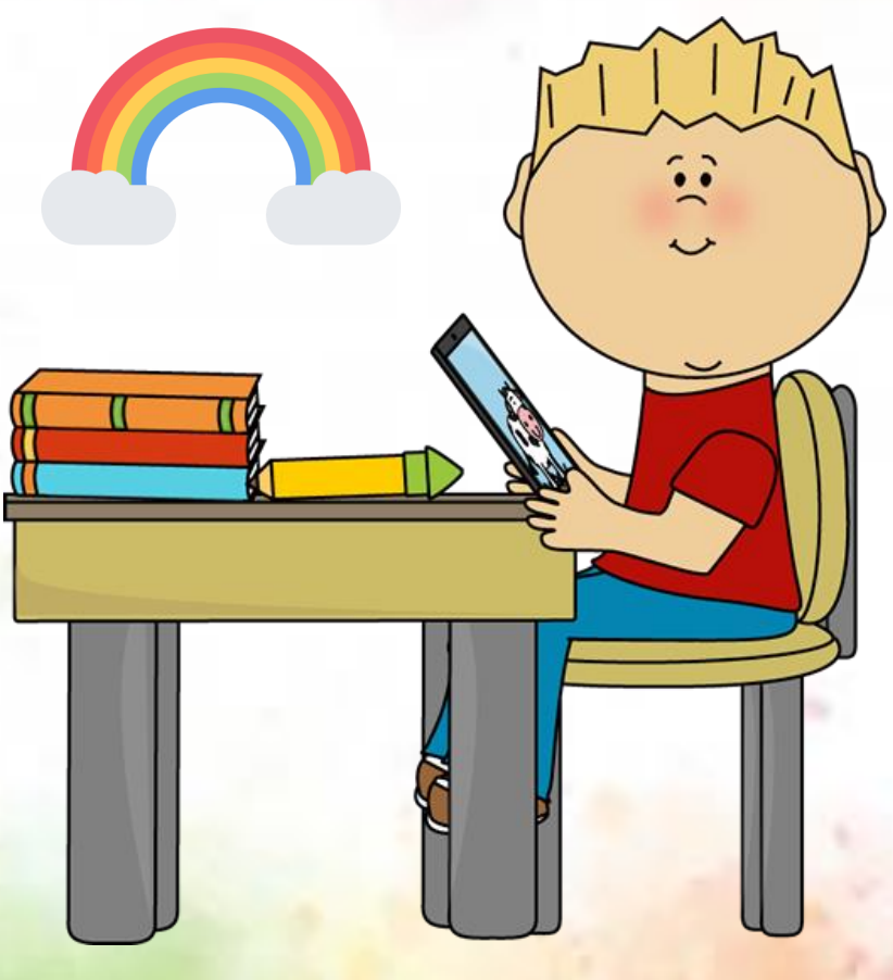
Working at your own desk